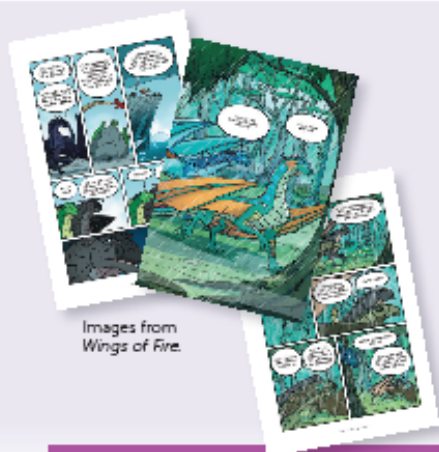
Images from Wings of Fire .

Humans have been telling stories through pictures for thousands of years, like the hieroglyphics of the Ancient Egyptians and the cave paintings from the Ice Age!