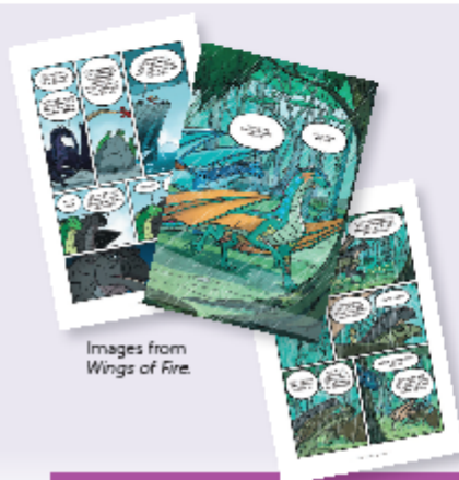
Images from Wings of Fire .

Humans have been telling stories through pictures for thousands of years, like the hieroglyphics of the Ancient Egyptians and the cave paintings from the Ice Age!